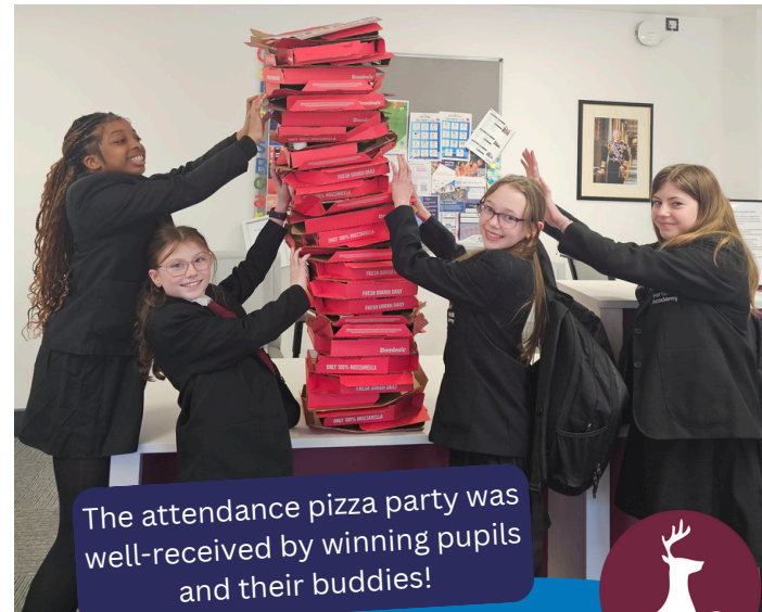
The attendance pizza party was well-received by winning pupils and their buddies!

We have seen improvements in attendance, as more young people and their families engage with the various activities and events to support and reward good attendance.