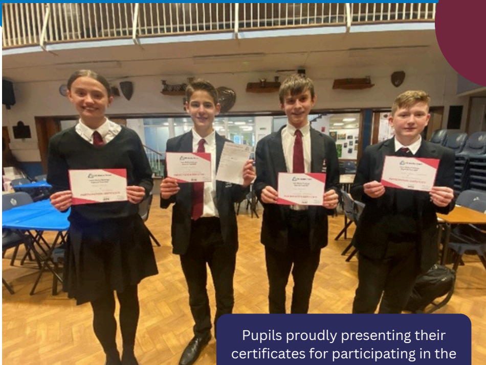
Pupils proudly presenting their certificates for participating in the UKMT Maths Challenge.

The UK Maths Trust is the leading charity that advances the education of young people in maths. For over 20 years the trust has been inspiring a love of problem solving through maths challenges and enrichment activities , delivered by hundreds of volunteers .