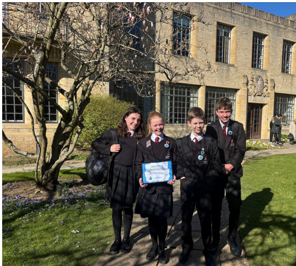
Celebrating success: Pupils display their certificate and badges after presenting their sustainability project at the University of Oxford