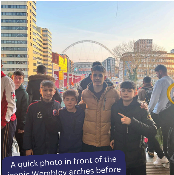
A quick photo in front of the iconic Wembley arches before the game kicked off.

The Spring Term has been a great opportunity for our young people to build upon the good attendance from earlier in the academic year.