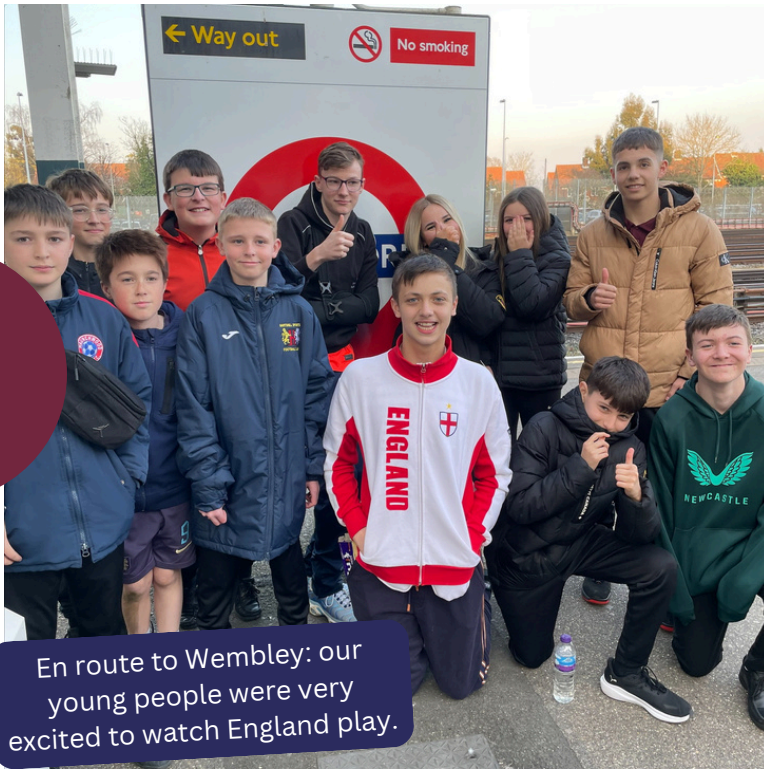
En route to Wembley: our young people were very excited to watch England play.